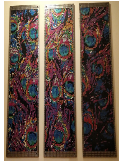
Vermont St housemates have been creating something truly wonderful.