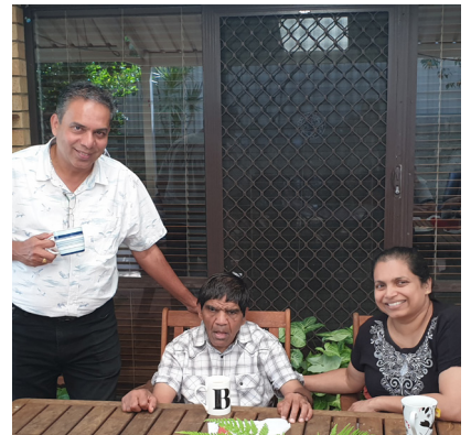
Easter celebrations at Ganges with family and neighbours