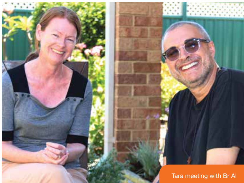
Tara meeting with Br AI